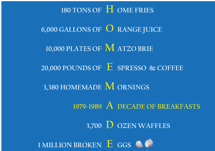
Figure 1.3. The Homemade Cafe [R29]

Figure 1.3 appeared on the back of Berkeley California's Homemade Cafe tenth anniversary tee shirt in 1989.